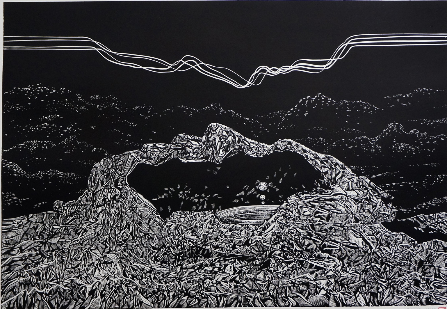
Wari Saengsuwo, "Facial of expectation No. 1", 2018